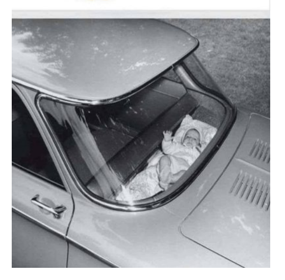
The Classic Chronicles

The 1960 Corvair dash baby cradle. - A safe, comfortable way to carry your baby before car seats were even a concept... warmest place in the car, it has a rear engine, and the engine vibrations lulls the baby 😲 😑